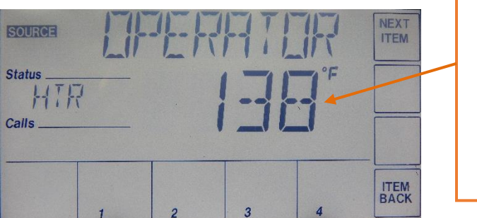
STAND ALONE OPERATOR ADJUSTMENT. Adjust screw until parameter reading matches the operating set point.