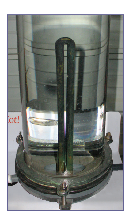
Treated No scale with treatment