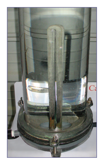
Untreated Scale build-up in untreated water